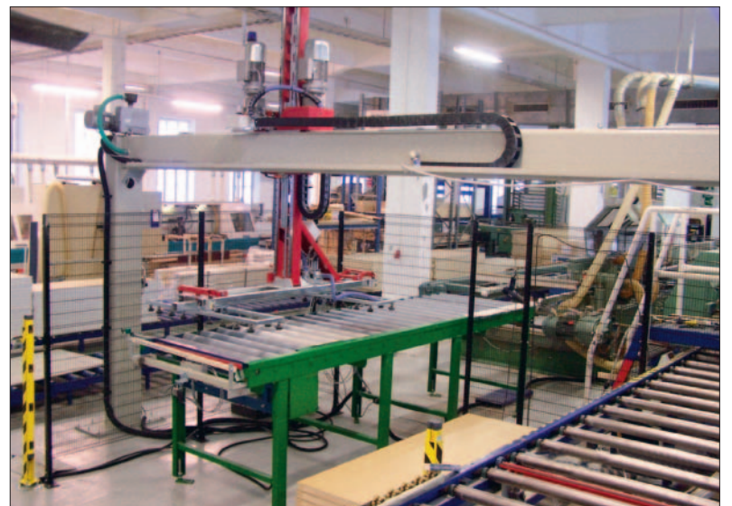
Pinomatic stacker and conveyor systems.

Pinomatic Ltd is a company that looks after advantages to the customers. The business idea is to be competitive through strong R&D and to achieve long-term relationships with customers by completely meeting their needs. Every project has its own reason. The solutions that have been done earlier are not repeated in other production lines, as every customer has their own idea of how to