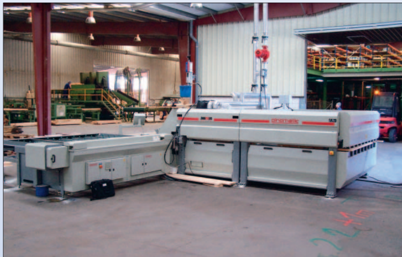
Pinomatic Innova LLP2500.